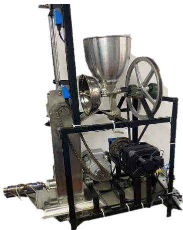
Fig. 2. Assembled prototype. Reference: Authors.