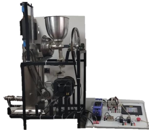
Fig. 4. Finished prototype.