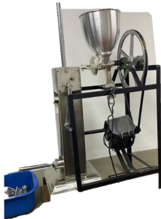
Fig. 1. Initial stage in the construction of the prototype.

These results demonstrate the viability and effectiveness of the developed prototype, as well as the adequate functionality of the implemented control interface. The recommendations from the experimental tests support the efficiency of the system in automating the briquetting process, thus laying the foundation for its possible implementation in larger scale industrial applications.