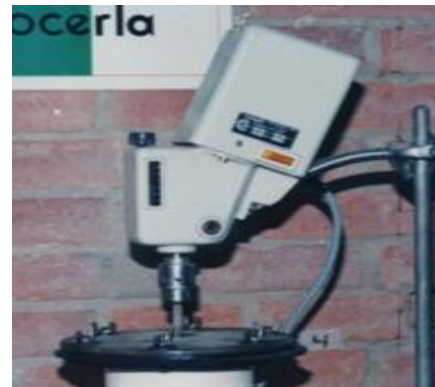
Fig 2. Rotation system slow

sediment present some kind of disturbance, see figure 2.